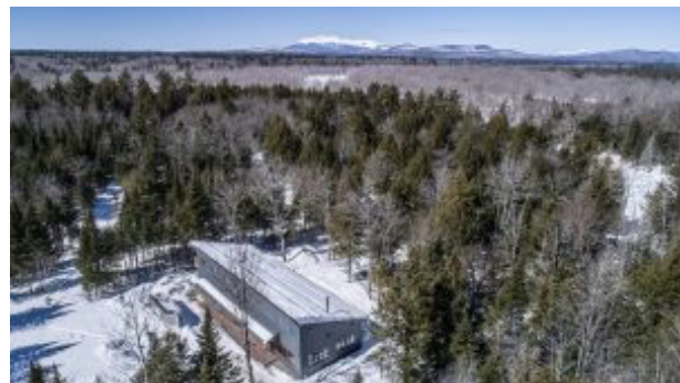
View looking northwest over PRT HQ building towards Mt. Katahdin