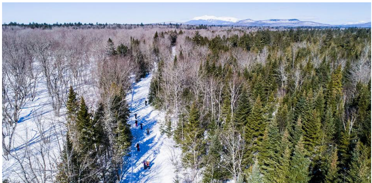
View looking northwest over PRT groomed XC trails towards Mt. Katahdin