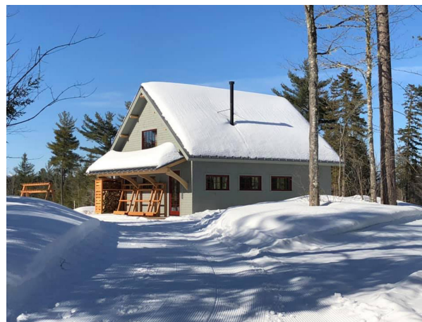
Pines and Ridges Warming Hut